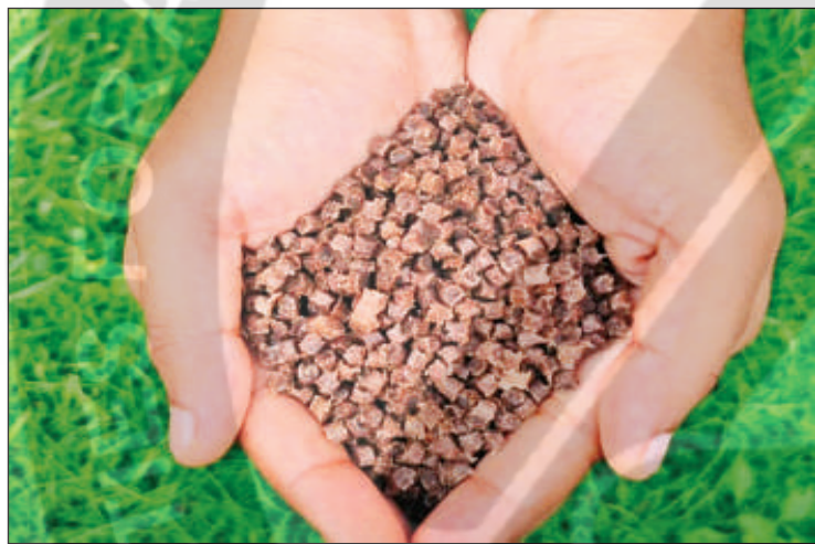
Biodegradable Coir Composite Pellets Developed by CSIR-NIIST

A plastic straw takes around 200 years to decompose, plastic bottles take around 450 years, plastic cups take about 450 years, toothbrush around 500 years, and disposable diapers take around 500 years to degrade. Minute