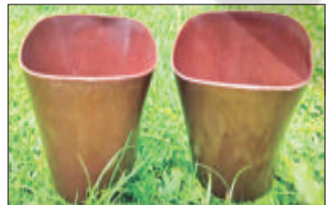
Biodegradable Garden Pots Made of Biodegradable Coir Pellets