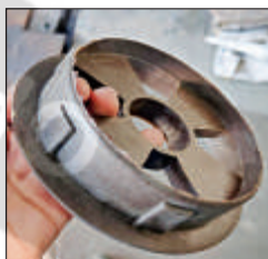
Injection Moulded, Decomposable Core Plugs from Coir-Based Pellets for Textile Industry