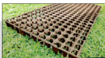
Drain Cells Made from Biodegradable Coir Composite Pellets

plastic fragments known as Micro and Nano Plastics (MNPs) contaminate the ecosystem and harm the wildlife. Apart from environmental damage, plastic causes health hazards as well. In case of the wildlife, whether in sea or land, ingestion of plastics are fatal as these choke their organs through accumulation. These tiny